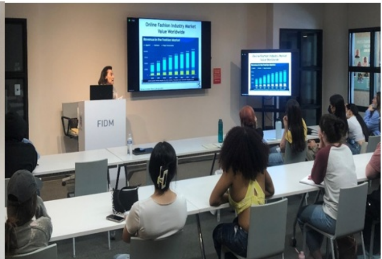
...a full room of participating students and educators